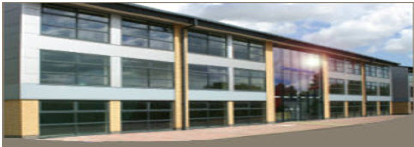
Our new home, Epsilon House